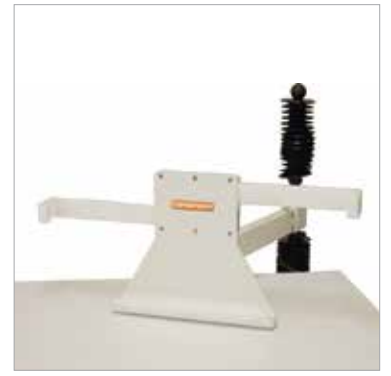
Lateral Detector/Cassette Holder